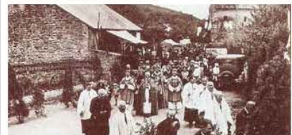
Procession in honor of the Miracle