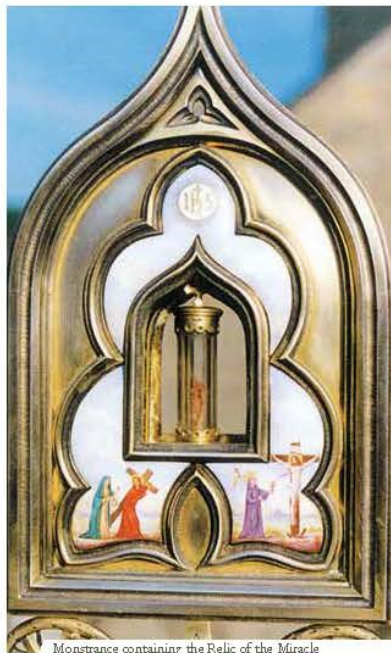
Monstrance containing the Relic of the Miracle

The Eucharistic Miracle of Blanot took place during the Easter Mass of 1331. During Communion, a Host fell to a cloth that was held below the communicant's mouth. The priest tried to pick it up, but it was not possible. The Host had transformed into Blood, resulting in a stain – the same size as the Host – on the cloth. That cloth is preserved today in the village of Blanot.