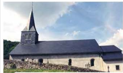
Parish of Blanot