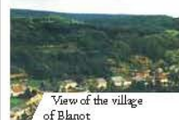
View of the village of Blanot