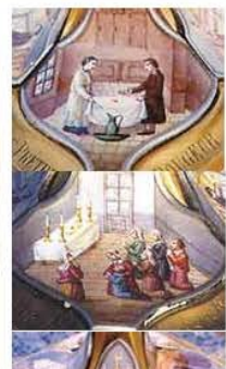
Details of paintings that decorate the Monstrance