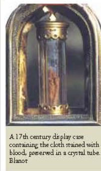
A 17th century display case containing the cloth stained with blood, preserved in a crystal tube. Blanot