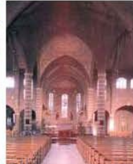
Interior of the church