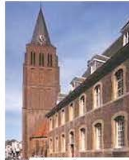
Church of Saints Peter and Paul at Boxmeer

During a Mass in Boxmeer, in Holland, in the year 1400, the species of wine was transformed into Blood and bubbled out of the chalice, splashing onto the corporal. As soon as the priest, terrified at the sight, asked God to forgive his doubts, the Blood stopped bubbling out of the chalice. The Blood that had fallen on the corporal coagulated into a lump the size of a walnut. Even today one can see the Blood, which it has not changed at all over time.