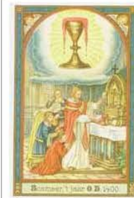
Boxmeer, 1 jaar 9 21 1900