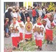
Procession in honor of the miracle

and paintings. Popes Clement XI, Benedict XIV, Pius IX and Leo XIII all showed a particular devotion to the miracle.