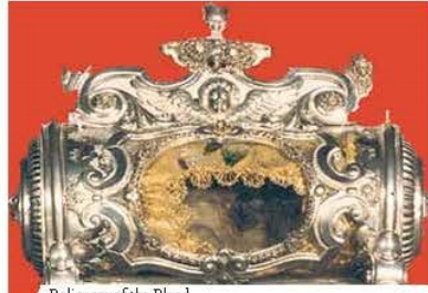
Reliquary of the Blood