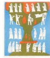
Procession in honor of the Eucharistic Miracle