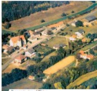
Panoramic view of Weiten

In fifteenth-century Austria there were a number of thefts of consecrated Hosts, so Church authorities took to keeping the Hosts in the sacristy. Despite these precautions, a thief succeeded in 1411 in stealing a consecrated Host from the parish church in Weiten. The Host slipped unnoticed to the ground during his journey and was discovered several days later by a pious woman. The Host glowed brilliantly, divided in two pieces but united by threads of bleeding flesh.