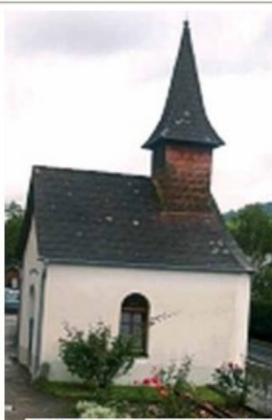
Chapel built on the exact spot where the Host was found