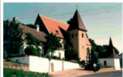
Weiten's parish church