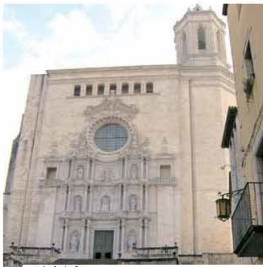
Cathedral of Gerona