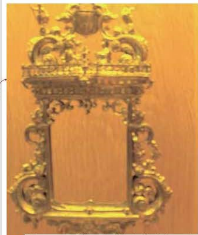
The monstrance which contained the blood-stained corporal, museum of the Cathedral of Gerona

This is why he had wrapped It in one of the corporals and left It on the altar. The little piece which was changed into flesh was then placed in a reliquary. Unfortunately a lot of the relevant documents to the miracle became lost: The reliquary containing the Incarnate Host and the Blood-soaked corporal were destroyed during the civil war of 1936.